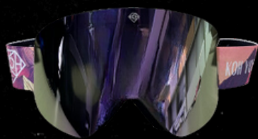
CLICK & CLACK PRO 2401