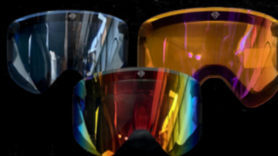
EXRTRA LENS 40002