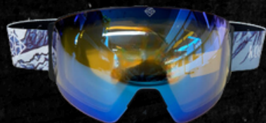
4X4 PRO 2301